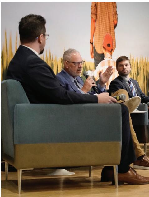
Summer Meeting 2025