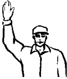
STOP – Raise hand upward, arm fully extended, palm to the front. Hold that position until the signal is understood.