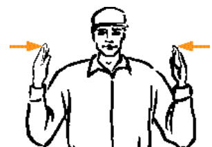
THIS FAR TO GO – Put hands in front of face, palms facing each other. Move hands together or further apart to indicate how far to go.