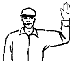
RIGHT TURN – Left hand and arm extended upward at the elbow