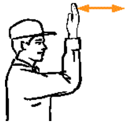
MOVE TOWARD ME / FOLLOW ME – Point toward person or vehicle you want moved. Hold one hand in front of you, palm facing you, and move your forearm back and forth.