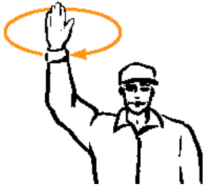
COME TO ME – (may mean “Come help me” in an emergency): Raise arm vertically overhead, palm to the front, and rotate in large horizontal circles.