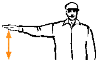
SLOW IT DOWN / DECREASE SPEED – Extend arm horizontally sideward, palm down, and wave arm downward 45° minimum several times, keeping arm straight. Don't move arm above horizontal.