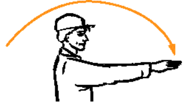
MOVE OUT / TAKE OFF – Face desired direction of movement. Extend arm straight out behind you, then swing it overhead and forward until it's straight out in front of you with palm down.