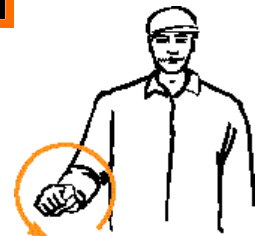
START THE ENGINE – Move arm in a circle at waist level, as though you were cranking an engine.