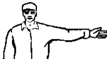
LEFT TURN – Left arm extended horizontally