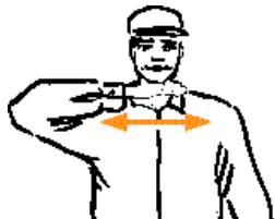
STOP THE ENGINE – Move your right arm across your neck from left to right in a “throat-cutting” motion.