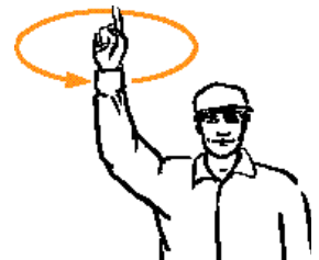
RAISE EQUIPMENT – Point upward with forefinger, making a circle at head level with your hand.

F A R M S A F E T Y M E A N S F A R M S A F E L Y